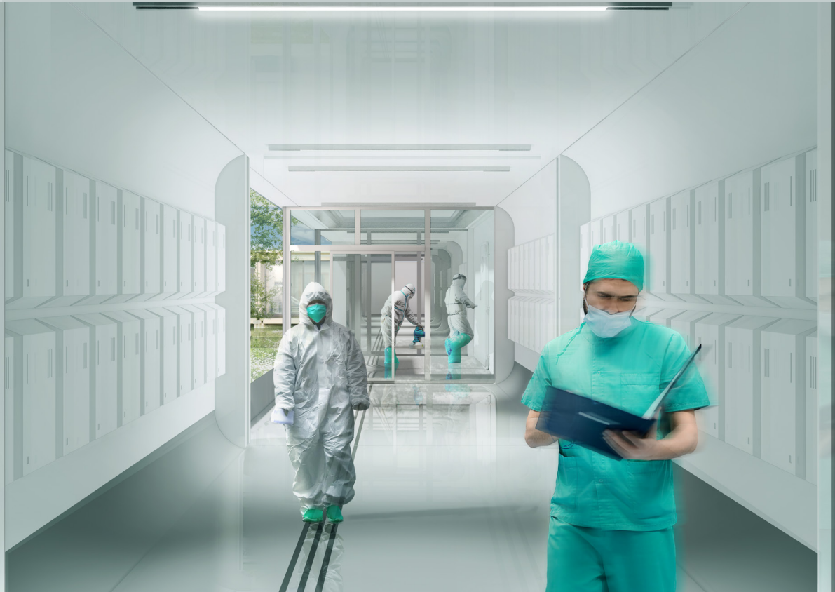
separate corridor system for patients and doctors

With the concept of The Vital House studio PROTOTYPE proposes a temporary health care center for the treatment of contagious diseases that can be constructed immediately close to the epicenters of future virus outbreaks.