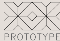
family contact room

As architects we can't cure people, but we can make a contribution to make things more pleasant in the future for these people.